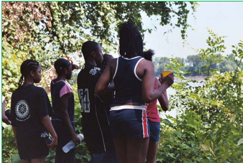
MPA's UPOP program continues to grow in popularity and scope allowing inner city kids to discover Missouri's state parks and historic sites.

opportunities to experience the natural and cultural resources of state parks and historic sites. For most it is their first exposure to the wonders of our state parks, and for some it may well be a life-altering experience.