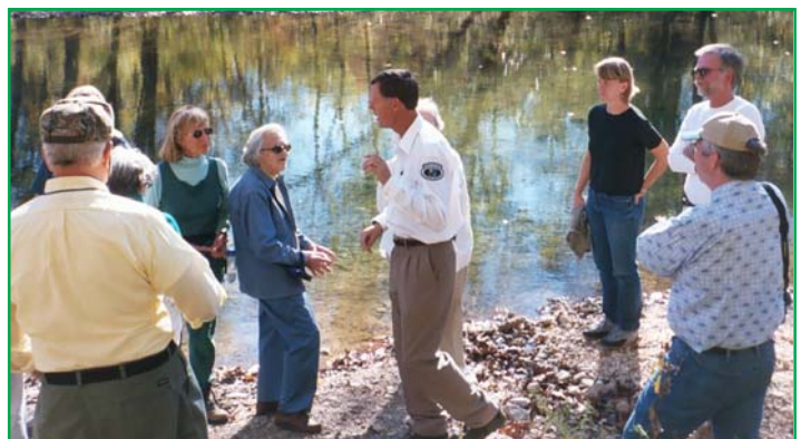
Parks staff and MPA members participated in a field trip to the site of the historic Parker School and Parker Hollow on the upper reaches of the Current River on a beautiful fall afternoon.

Please contact your state legislator to ask for support for SJR 49 to place the Parks and Soils Sales Tax issue on the 2006 ballot and automatically every ten years thereafter.