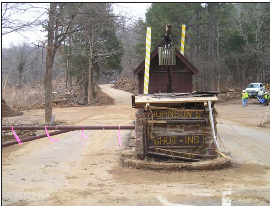
A view of the forlorn front entrance to Johnson's Shut-Ins State Park.