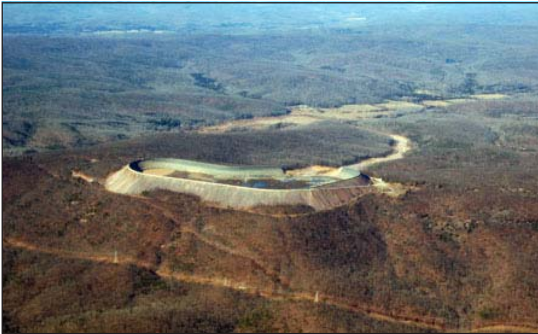
An aerial view of the breached reservoir looking down the scour channel toward the park.

As it was, the dam was overtopped but the water downstream rose only about two feet.