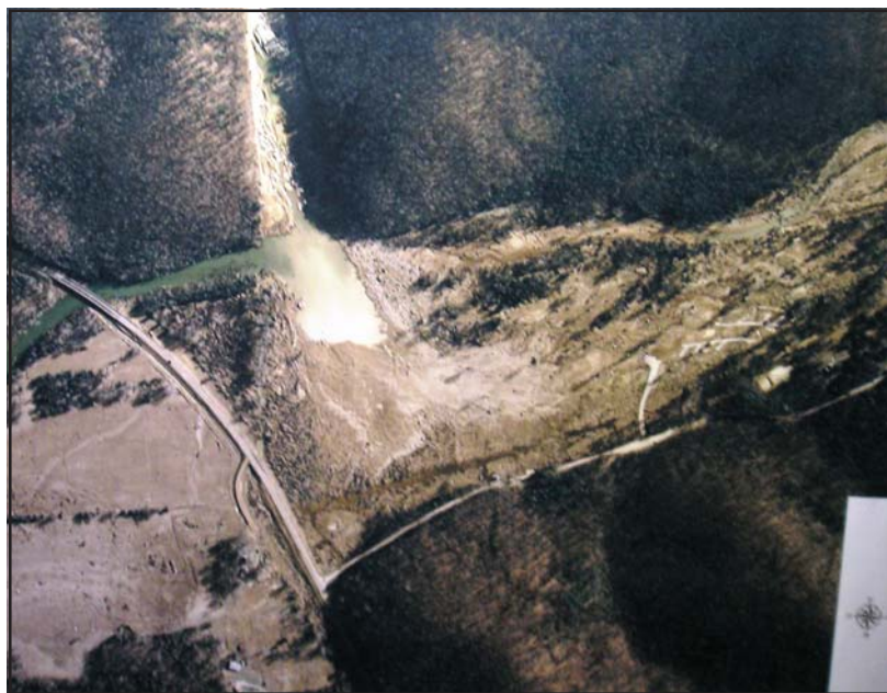
Aerial view of the park looking east across Black River at scour channel (top left) showing debris dam and impoundment (center), Route N (left), field where Toopses were found (far left), and entrance road to park (lower right).

Not least among the extraordinary occurrences was that there were no campers in the park the night of the flood, though the campground had been receiving steady use throughout the fall, and no one else was seriously injured or killed despite several trucks being washed from the road. If the breach had occurred during the summer, hundreds of people at the nearly always full park would likely have been injured or killed. And it was fortunate that the dam of the lower reservoir downstream from the park on East Fork Black River held, or a twenty-foot surge would have raced through Lesterville 3.5 miles south and on downstream.