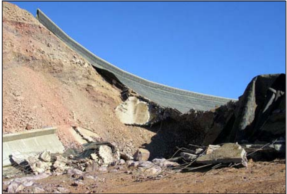
A view of the reservoir from the breach in the dam.

Ironically, the observations were made on a Sunday when workers are not ordinarily at the plant, but they were getting ready for a ceremony the next day at