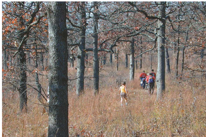
A woodland at Ha Ha Tonka with 300-year-old post oaks maintained by periodic fire.

percent of park staff during the economic crash of 2008, they weren't being replaced in the numbers and with the requisite skills of the earlier hires. There didn't seem to be as strong a sense of mission as in the 1980s and early '90s among park staff in general. And administrative