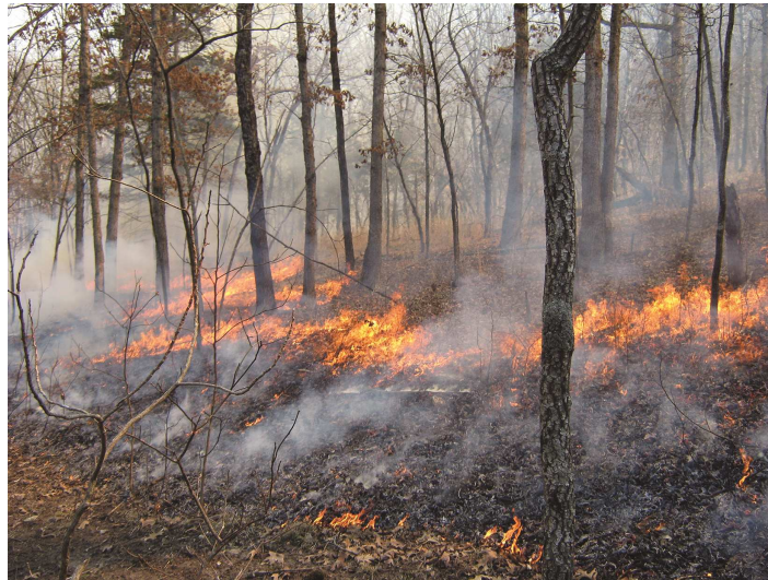
Prescribed burn in a woodland at Ha Ha Tonka State Park..

Wanting to expand these fledgling programs to restore and manage natural communities beyond the experimental and demonstration phases, Nelson in 1985 searched for